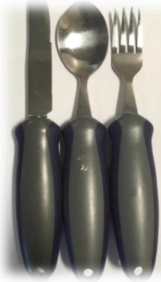
Eating and drinking?