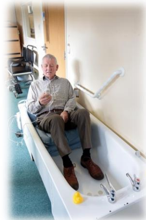
Having a bath or shower?