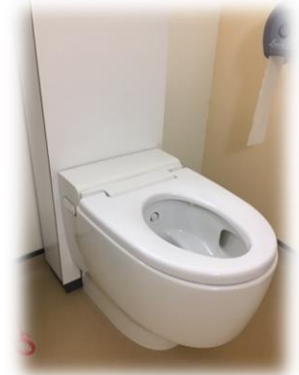
Getting to the toilet?