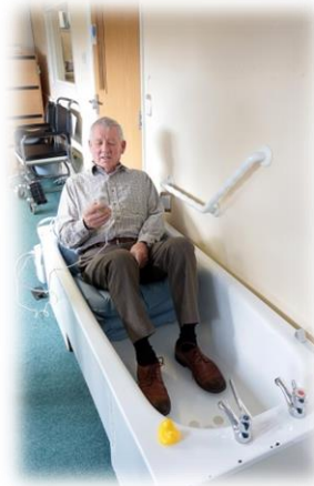
Having a bath or shower?